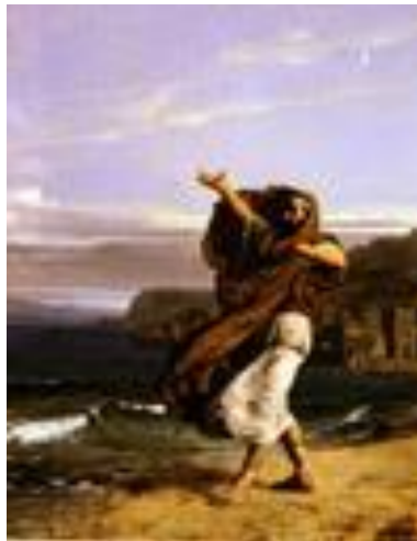
Demosthenes Practising Oratory (1870) Jean-Jules-Antoine Lecomte du Nouÿ(1842–1923)